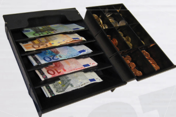
V-15B-26 (Euro Insert)

Key Options: Four keylock codes, keyed alike or random