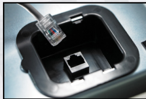
APG 320 (24v) and 420 (12v) interface options available