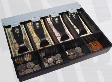
V-15B-27 (US Till)